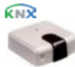
IS-IR-KNX-1i (CL 99 096)