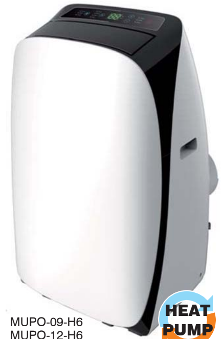
MUPO-09-H6 MUPO-12-H6 (Heat pump)