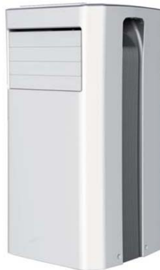
MUPO-07-C6 (Cooling only)

FOLLOW ME FUNCTION (IFEEL) The wireless remote control adds a temperature sensor.