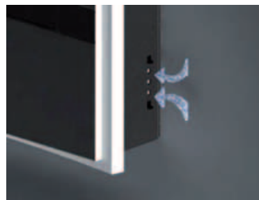
Fresh air intake