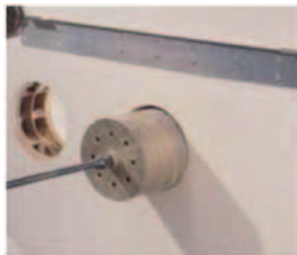
Two holes Ø162 mm