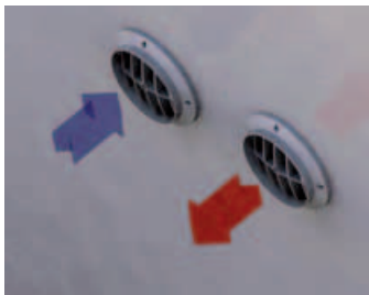
EPDM rubber (patented) exterior grating