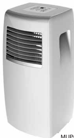
MUPO-07-C4 (Cool only)