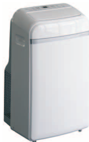
MUPO-12-H4 (Heat pump)